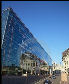
DE-LAN mid-term conference